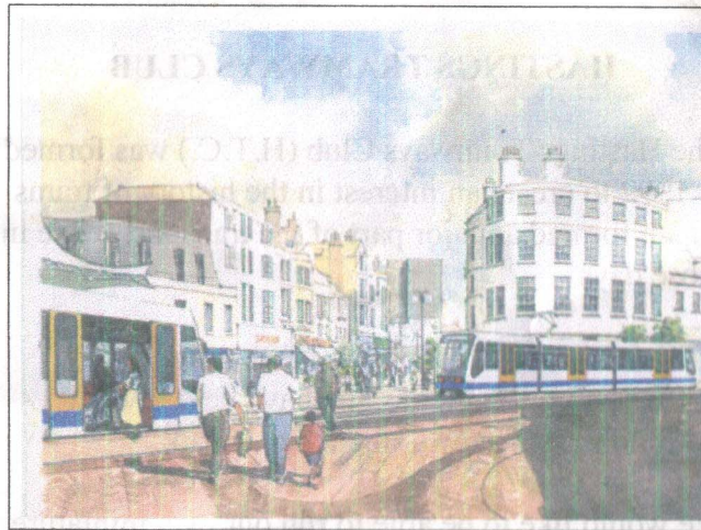
A Future Image of Hastings Town Centre with a modern Tram. From a painting by Mike Turner.