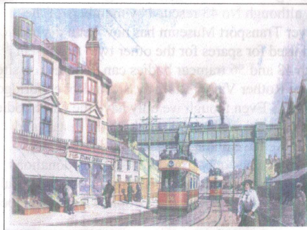
Tram No 56 at Queens Road Railway Bridge. From a painting by Mike Turner.